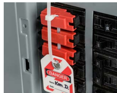
120V breaker lockout devices fit on breakers next to each other, enabling multiple tagouts at one time