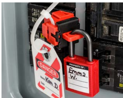
Securable by BOTH cable tie and safety lock at the same time