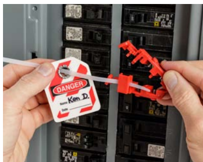
Save time by "pre-loading" your tag and cable tie before walking to the energy point