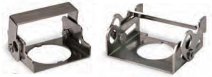
Emergency Stop Cover NEMA 30.5mm (PBL2)