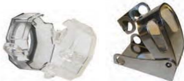
Push Button Cover NEMA 30.5 mm (PBL6)